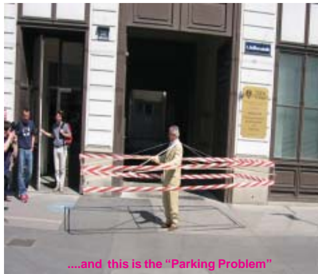
....and this is the "Parking Problem"

35. Levy of a high parking fee, that truly represents the value of the land occupied, should be used as a means to make the use of public transport more attractive. Preference in the allocation of parking space for public transport vehicles and non-motorized modes